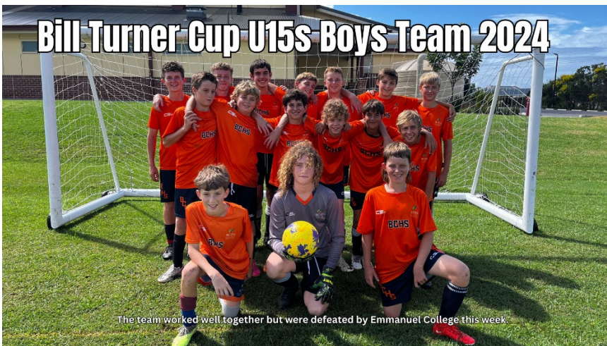
Bill Turner Cup U15s Boys Team 2024