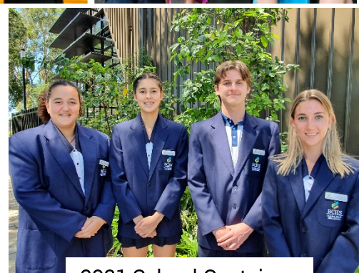
2021 School Captains

Wishing everyone a safe and happy chocolate-filled holiday.